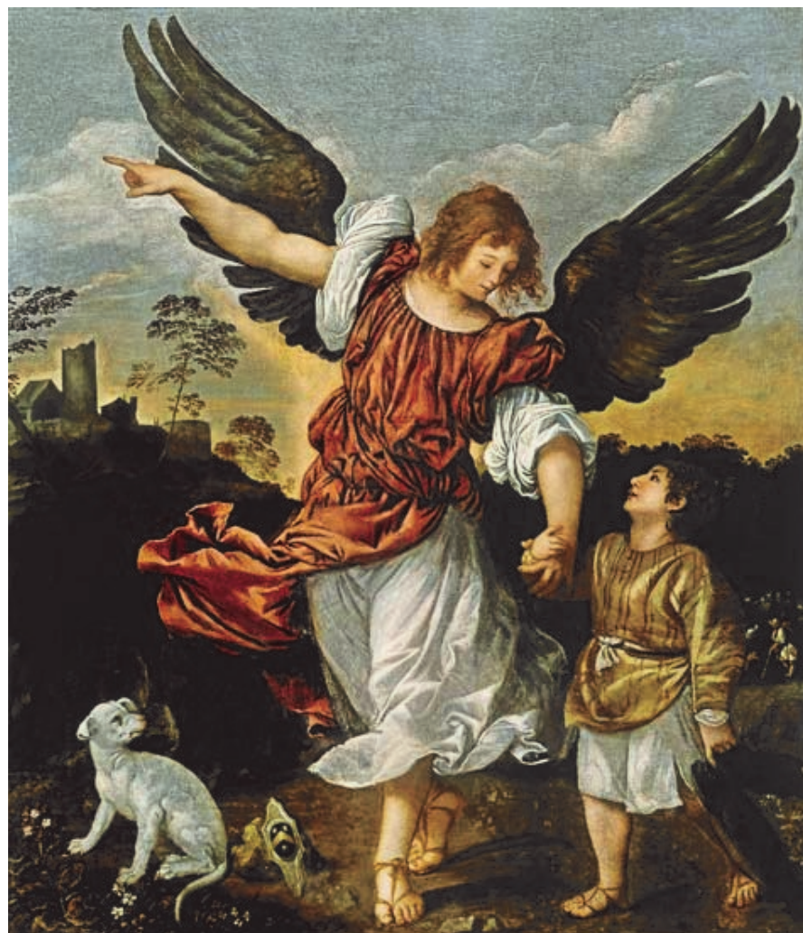
Tobias and the Archangel Raphael—School of Titian